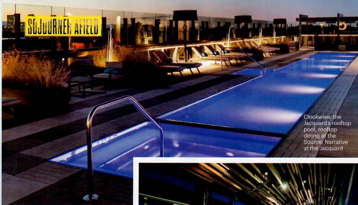
Clockwise: the Jacuzzi's rooftop pool; rooftop dining at the Source; Narrative at the Jacquard